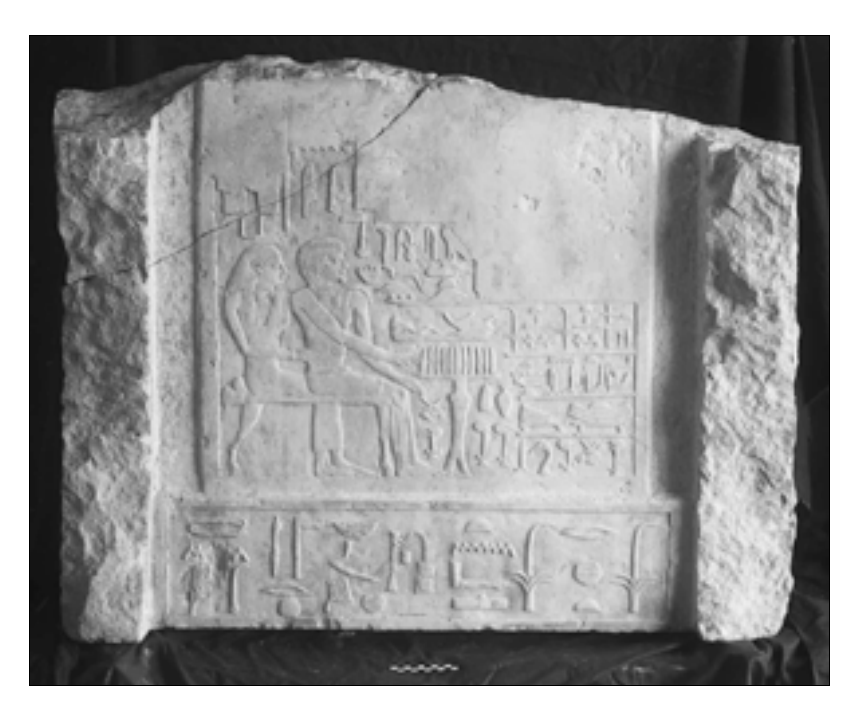
Plate IIA. "Studio" photograph of the tablet of Tjenti (Cairo JE 72135) taken by Expedition Photographer Mohammedani Ibrahim at Harvard Camp, Giza, on December 10, 1937 (A 7884). Courtesy Museum of Fine Arts, Boston.