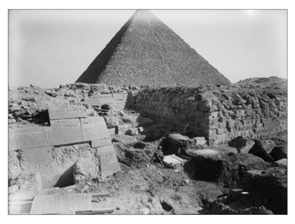
Plate I. The tablet of Tjenti re-used as roofing slab over shaft G 2113 C, looking southeast, December 3, 1937; photograph by Expedition Photographer Mohammedani Ibrahim (A 7883). Courtesy Museum of Fine Arts, Boston.